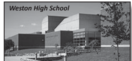
Weston High School